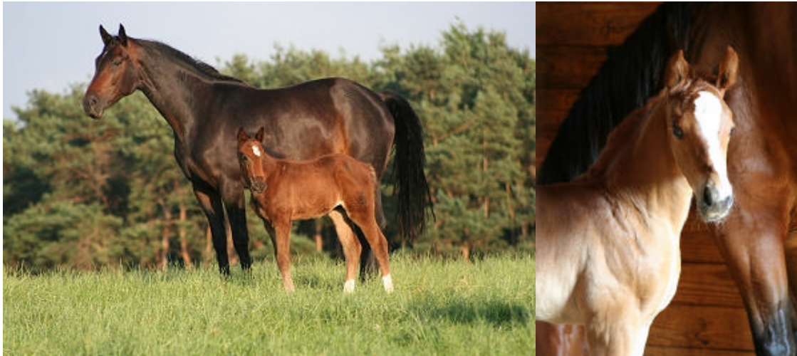
Ars Vivendi filly out of StPrSt Escarda Breeder: Beth Dzaugis